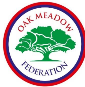
Oak Meadow Federation